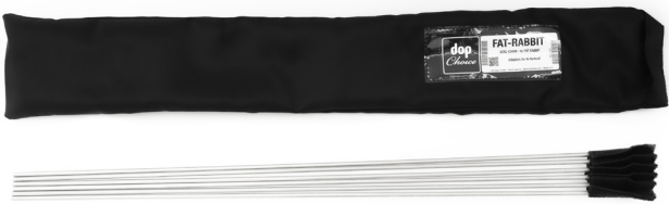
SRXL-CS4V8 content: 6x Short Poles with Velcro Pad / Transport Bag

PLEASE ALSO REFER TO THE LUMINAIRE INSTRUCTIONS REGARDING USE OF ACCESSORIES.