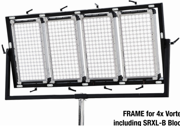
FRAME for 4x Vortex8 including SRXL-B Blocks